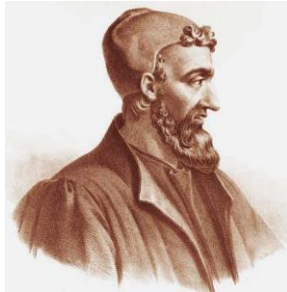
Galen of Pergamum, undated lithograph

Many ancient peoples thought that disease was a punishment imposed by the gods for bad behavior. The ideas of Galen of Pergamum , a Roman physician who lived around 200 AD, influenced Western medicine for nearly 2000 years. One of his theories was that disease was caused by miasma , a poisonous vapor which carried particles of rotting materials. This idea made sense to people who knew that eating spoiled food, drinking dirty water, or breathing polluted air could make you sick. People did not know that microorganisms existed, and they didn't realize that disease could be passed from a sick person to another, healthy individual.